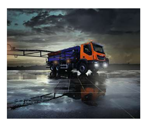
ACE Combination machine