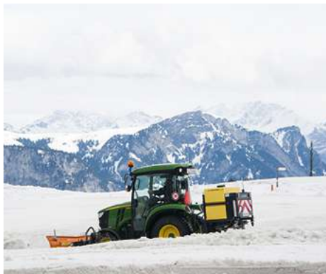
CSP Liquid system/Deicer