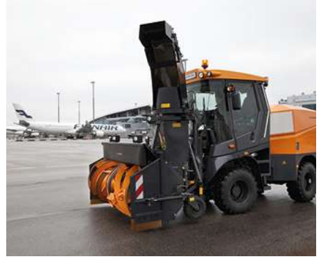
The Supra 5002 is a self-propelled snow clearing machine with a clearing width of either 2400, 2600 or 2800 mm.