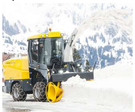
The Supra 4002 is a self-propelled snow clearing machine with a clearing width of either 2400, 2600 or 2800 mm.