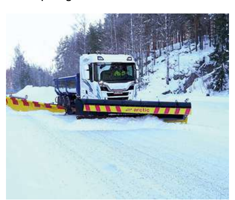
SHJ Snow plough