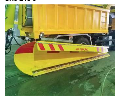
SHJ 218 J