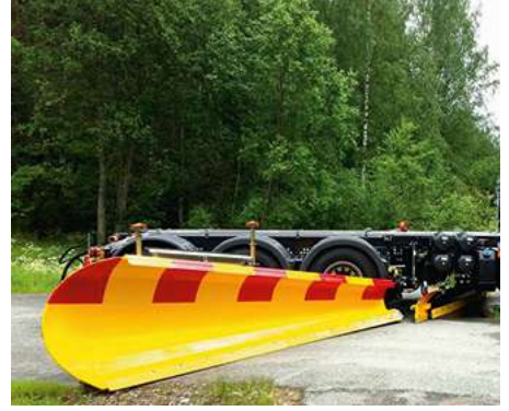
SHJ 216 J