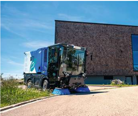
eSwingo 200+ Street Sweeper