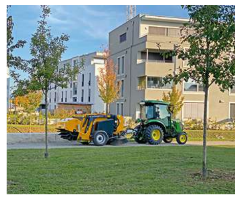
Wasa 300<sup>+</sup> Sweeper